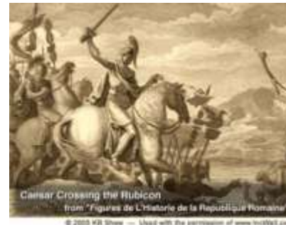
Caesar Crossing the Rubicon from "Figures de l'histoire de la République Romaine" © 2003 KR Stone — Used with the permission of www.teachers.com